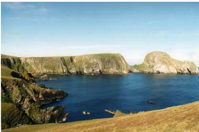
Panorama from Klingers Geo towards Hesswalls, Vaasetter, Klavers Geo & Sheep Craig on the east side of Fair Isle. Area notable for its ship wreck sites and the island's newest Gannet colony.