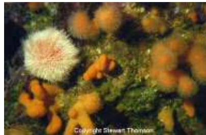
Echinus & Alcyonium digitatum, Fair Isle.

In summary, the whole of the marine environment around the isle is rich in marine life and the waters unpolluted and crystal clear. There is also potential to establish Fair Isle as a marine life monitoring station within a national network.