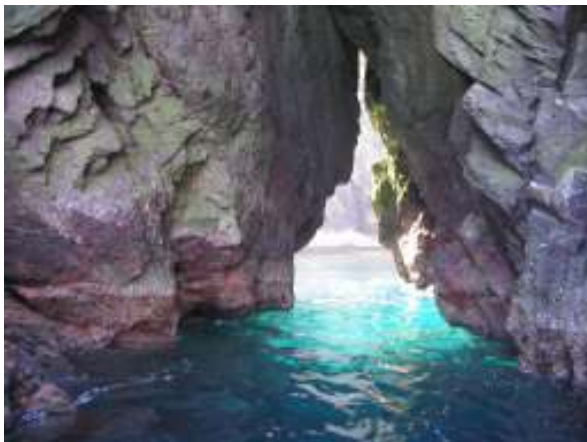
Eye o' Kunnis on the west side of Fair Isle.

In summary, there are no back-up facilities on the isle so visiting divers should come fully prepared.