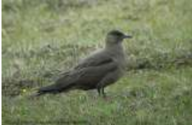
Dark phase Arctic Skua, Fair Isle.

Arctic Skuas Stercorarius parasiticus have been in trouble since 1998 with falling numbers and very low breeding success. The years 2003-05 saw a total of just ten birds fledge. Things improved dramatically in 2006 with the highest number of AOT (105) since the early 1990s and good productivity (0.82). In 2007 however, the situation deteriorated once again and from 68 AOT (a 35.2% decrease), not a single chick fledged.