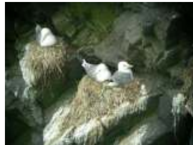
Black-legged Kittiwakes on nests, Fair Isle.

Kittiwake Rissa tridactyla : the species in most trouble! Numbers of AON at the plots continued to fall (by 27.0% since 2006) to the lowest ever – 82.4% less than in 1987. Although the vast majority (91%) of pairs built nests and laid eggs, 44.8% failed at this stage whilst those chicks that did hatch were lucky to survive beyond two weeks. Only four chicks fledged from 254 nests on the monitoring plots – only the complete failures of 2003 and 2004 have been worse. Depredation and starvation were the cause of failure. Many chicks and adults regurgitated snake pipefish and these were also evident as discards in nests indicating a lack of availability of favoured food (i.e. sandeels).