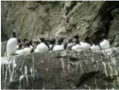
Common Guillemots, Fair Isle.

Guillemot Uria aalge : numbers of birds on the plots were the lowest on record (32.5% less than in 2006) and only small numbers of eggs were laid. Productivity at the two monitoring sites was markedly different: Peitron 0.47 and Da Swadin 0.06 (mean 0.37). Observations during ringing trips into various colonies would suggest that the figure from Da Swadin was (unfortunately) more representative of the isle as a whole. Feeding watches indicated that provisioning rates were very low (1.9 feeds/chick/day) and although 56.6% of food items were sandeels, these were of less than average size.