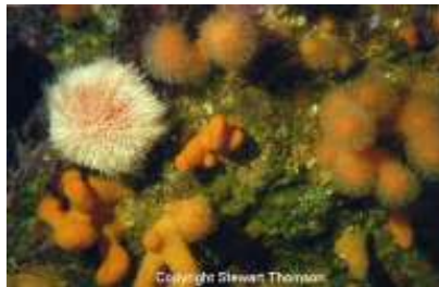
Echinus & Alcyonium digitatum, Fair Isle.

In summary, the whole of the marine environment around the isle is rich in marine life and the waters unpolluted and crystal clear. There is also potential to establish Fair Isle as a marine life monitoring station within a national network.