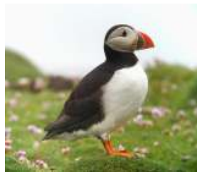
Atlantic Puffin, Fair Isle.