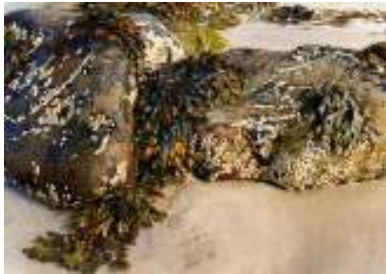
Seashore communities, Fair Isle.

The Wildlife Club proved popular again in 2007 and included a mix of terrestrial and seashore activities. Trips to the shore took place in March and August and again in January 2008 and revealed a stunning array of marine life – many of which only became apparent only after follow-up scrutiny with a microscope. The observations and findings prompted articles with the titles Low Tide at North Haven , Beasties and Flora of North Haven and Winter on the Shore . Accounts of all the Fair Isle Wildlife Club trips can be found at www.fairisle.org.uk .