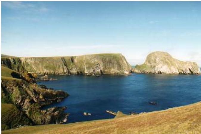
Panorama from Klingers Geo towards Hesswalls, Vaasetter, Klavers Geo & Sheep Craig on the east side of Fair Isle. Area notable for its ship wreck sites and the island's newest Gannet colony.