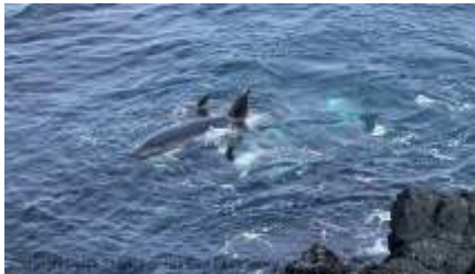
Orcas (Killer Whales), Fair Isle.

March: Three Orca were seen off South Light on 22 nd .