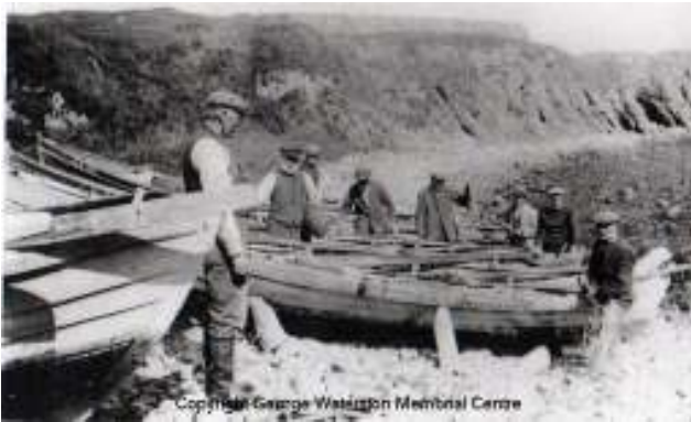
'Fair Isle fishermen & their boats'.

It is only when people visit the isle that they gauge the strength of feeling and determination of the community; and the socio-economic justification of our aspirations – a message conveyed politely but clearly by everyone.