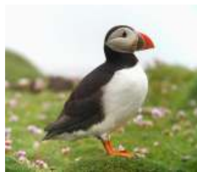
Atlantic Puffin, Fair Isle.