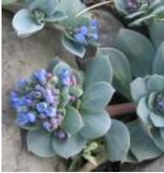
Oysterplant at Muckle Uri Geo, Fair Isle. Photograph © Rona Burton 2008.

The oysterplant Mertensia maritima is a rare and declining plant of Scottish coasts. It colonized Muckle Uri Geo shingle beach in the 1980s and, thanks to concerted conservation action by the Bird Observatory and Fair Isle Rangers, has blossomed into one of the finest colonies in Britain. A count of nearly 200 the previous year in no way prepared us for the explosion of plants in 2007. On 18 th July 2007, assisted by two IVS workcamp volunteers, we counted 2,600, including 176 medium and large rosettes in full flower. Perhaps “counted” is the wrong word because in some places the plants were so closely packed together that it was difficult to distinguish one plant from another; and, it was easier to estimate the large clusters of tiny plants scattered throughout the enclosure rather than making a direct count.